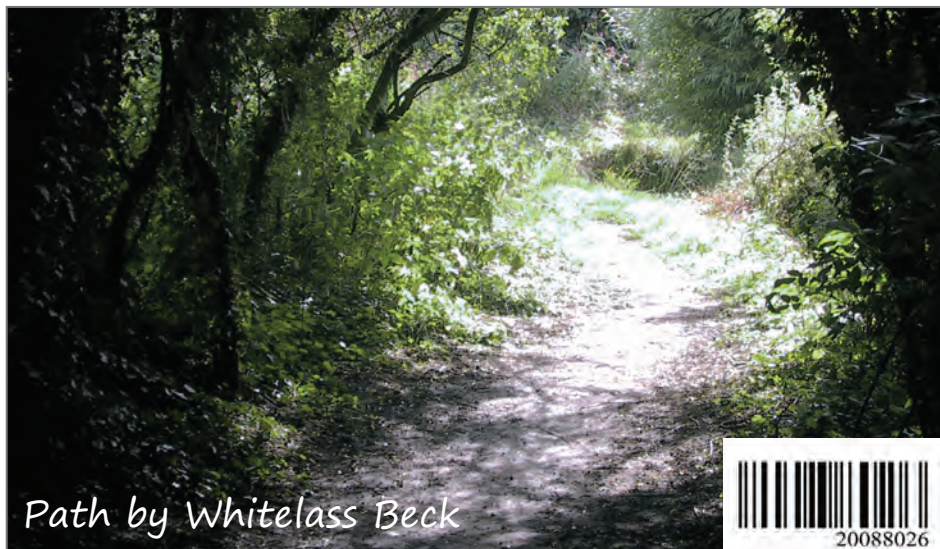
Path by Whitelass Beck

Go diagonally left towards another kissing gate about 200 metres away close to the Cod Beck again. Go up